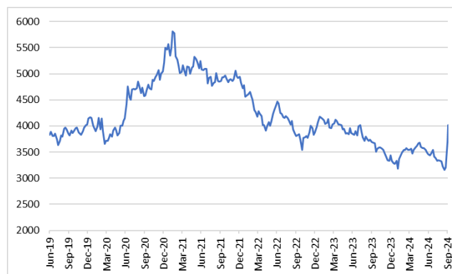
CSI China 300 Index

As a result, Chinese stocks experienced one of their best single day gains on record, the CSI China 300 Index rose 8.5%, its biggest daily gain since 2008. Over the last two weeks of the month the index rose 24%. As highlighted in the graph below, this comes after a prolonged period of underperformance.